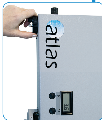
Fold adjustment knob and LCD readout