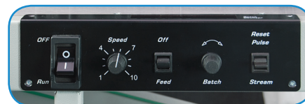
Easy-to-use control panel

* Speed varies depending on paper weight