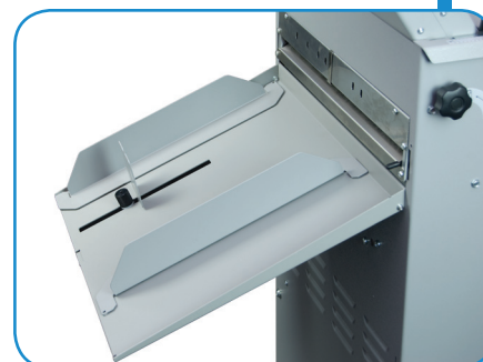
Perforation / score attachment, included

Formax - New Hampshire, USA www.formax.com